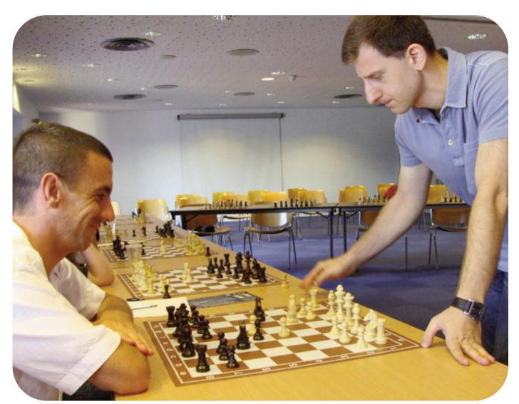
In Sunday's Chess Simultaneous event, International Grand Master Tigran Gharamian faced 30 opponents from all ages, as these pictures of some younger and older people clearly prove.